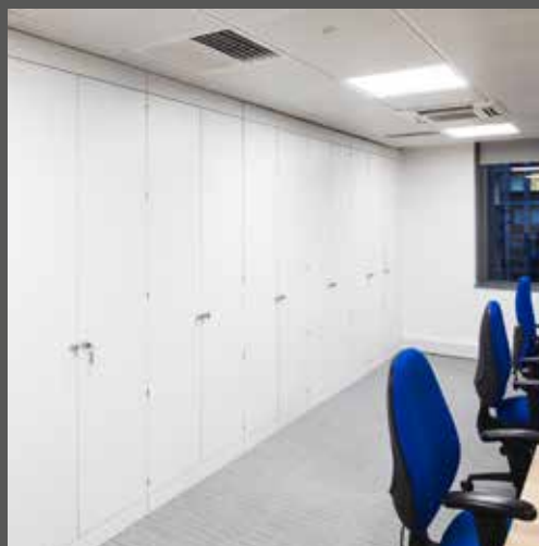
StorageWall in the open plan office area