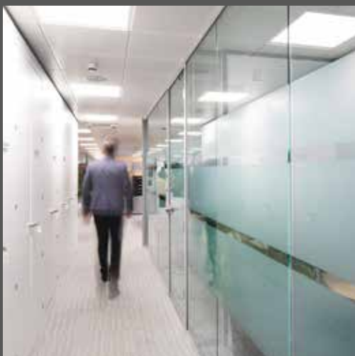
Meeting room with glass partitioning and manifestation opposite a StorageWall