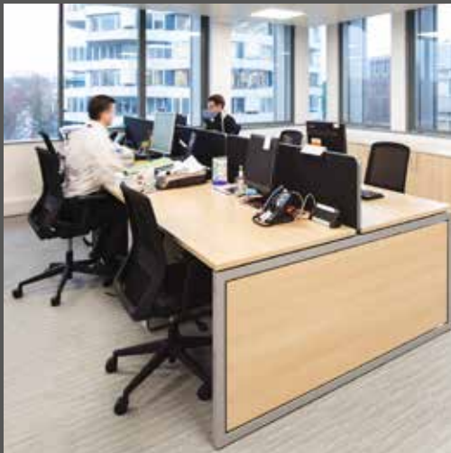
Infinity desking with ergonomic operator chairs