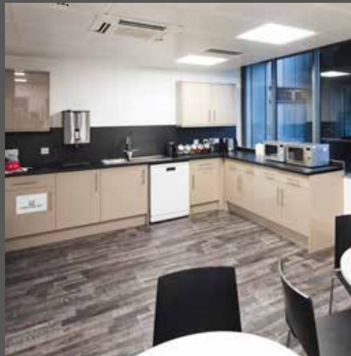
Teapoint and breakout area with seating