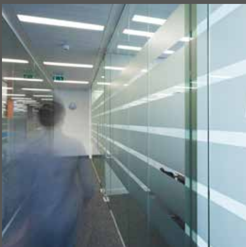
Meeting rooms and offices divided by glass partitions with manifestation.