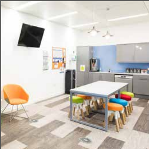
Feast Metal table with Spin Stools.