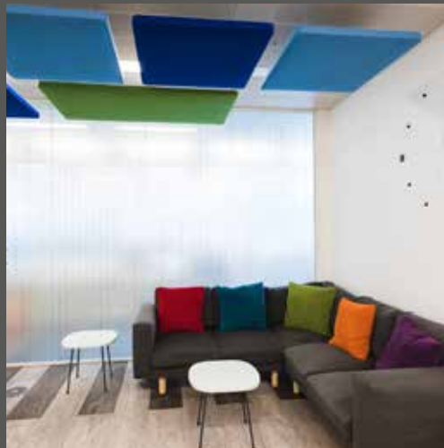
Uni coffee tables and Selva ceiling panels.